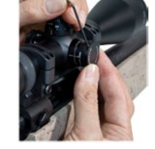
Align the windage turret cap.

Once the windage and elevation knobs are correctly indexed to the zero mark, temporary corrections can be safely dialed into the scope without worry of losing the original zero.