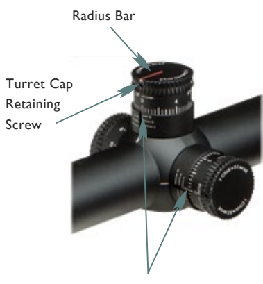
Zero Reference Lines

• Knob orientation is at the zero point when using the CRS feature.