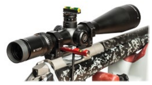
Using bubble levels to square the riflescope to the base.