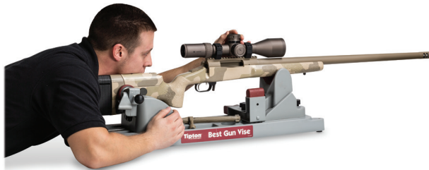
Visually bore-sighting a rifle.

Note: Be sure to read pages 11–12 prior to making adjustments.