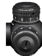
MRAD Models "1 Click = 0.1 MRAD"