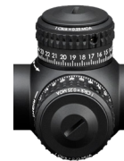
MOA Models "1 Click = 0.25 MOA"

Depending on which version you have purchased, your Razor HD AMG riflescope will feature adjustments and reticles scaled in MOAs or MRADs. Both minute-of-angle (MOA) and milliradian (MRAD) unit of arc scales are equally effective when ranging or adjusting riflescope for bullet trajectory.