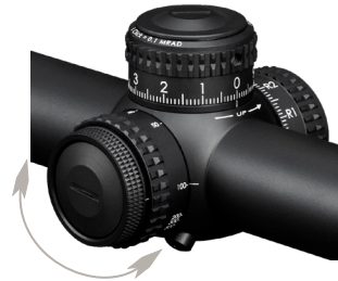
Rotate Side Focus Dial

Parallax is a phenomenon that results when the target image does not quite fall on the same optical plane as the reticle within the scope. This can cause an apparent movement of the reticle in relation to the target if the shooter's eye is off-centered. Correctly focusing the target image will allow it to fall on the same optical plane as the reticle within the riflescope.